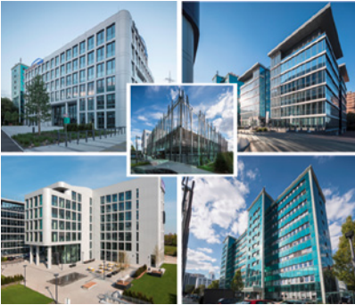
© Arminius Kapitalgesellschaft mbH/ Campus Eschborn

Our in-house Technical Service team offers professional expertise whenever and wherever you need it: any time of day, 365 days a year, throughout Germany. Flexible structures and a digital service portal ensure a high level of transparency. This guarantees we can keep your properties running smoothly.