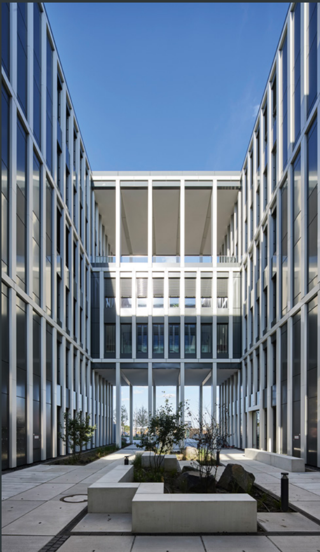
Office buildings, industrial buildings, retail, multi-storey car parks

Our Real Estate Services: As diverse as your portfolio.