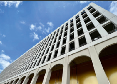
© Buhlmann Immobilien-Gesellschaft mbH/ Bremen Intercity Bus Terminal

Whether barrier- and contact-free parking and access technology, e-charging infrastructure or a mobility app: Our solutions are flexible, well thought-out, and aligned with the future of mobility. We offer bespoke and reliable services with a holistic view for all challenges to support you throughout the entire life cycle of your parking property.